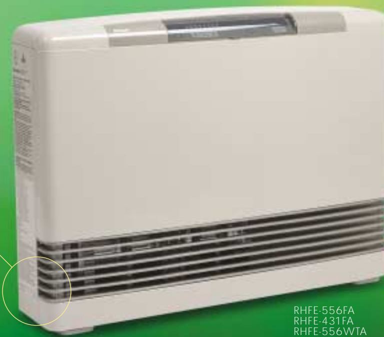
RHFE-556FA RHFE-431FA RHFE-556WTA RHFE-431WTA